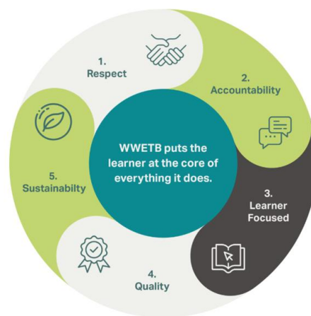
WWETB Core Values

Other major programmes include Music Generation which provides music performance education to thousands of young people across the two counties. We manage Youthreach and Youthwork projects, we provide Outdoor Education and Training (Shielbaggan), and we play a lead local role in supporting Ukrainians in education.